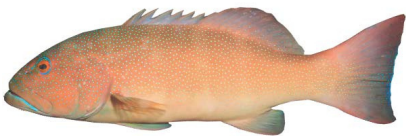
Common Coral Trout